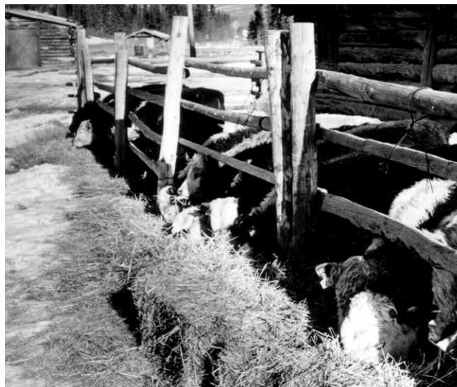
These young calves wintered well on high quality grass hay plus vitamin and mineral supplementation.

Most calf rations require mineral supplementation. Whenever possible, the minerals should be mixed in the grain portion of the ration. Minerals should also be offered free-choice. If you are feeding a considerable amount of legume forage, use a mineral supplement containing equal parts of calcium and phosphorus. A ration based on a grass hay, greenfeed or cereal silage should be supplemented with a mineral containing two parts of calcium and one part of phosphorus. When a ration contains two-thirds or more of grain it should contain 1 percent ground limestone. Trace mineralized (TM) salt should be available free-choice, or be added to the grain mix. Be sure the salt does not contain more than 0.02 percent iodine. Supplemental selenium should be included in the ration at a rate not to exceed 0.3 ppm whenever Alaska feeds are fed.