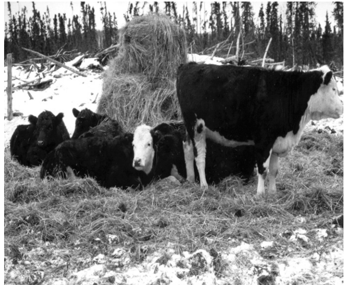
Large round bales are efficient and easy to handle with the right equipment. They must be fed from feeders to avoid excessive waste.

A one to one (1:1) calcium phosphorus mineral supplement may also be provided free-choice, although both calcium and phosphorus requirements are being met in these rations.